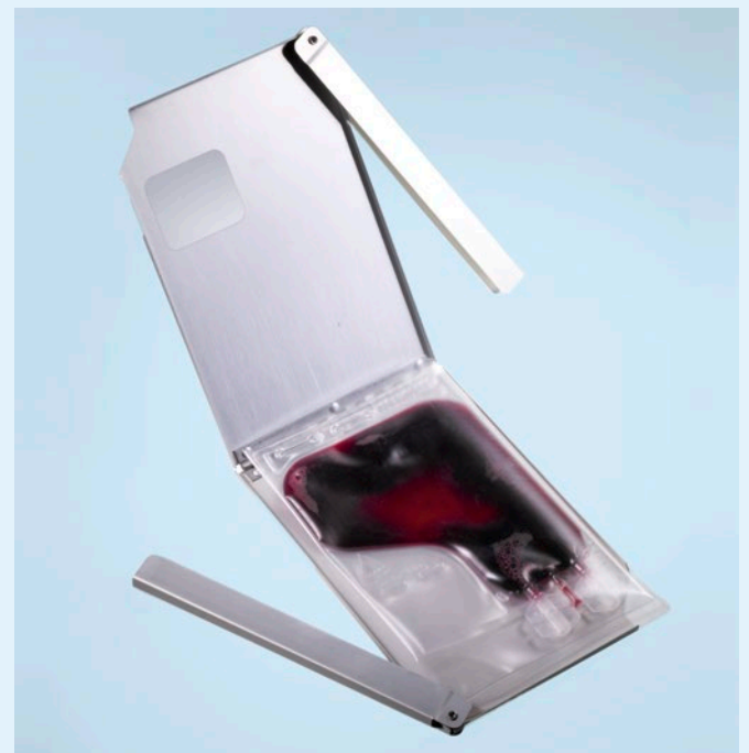
More protection in the same storage space