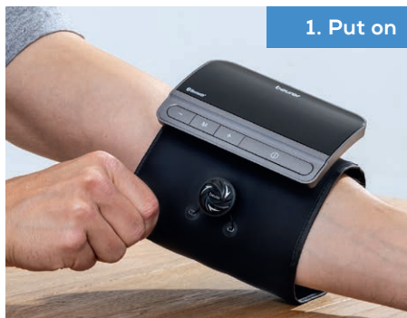
1. Put on

With the new BM 81 easyLock , annoying tubes and cables are a thing of the past. Thanks to a new design with integrated cuff, you can measure your blood pressure anywhere and at any time. The innovative easyLock system makes it easy for you to fix the device on your upper arm with the perfect fit and secure hold – without the need for a hook-and-loop fastener. The all-in-one solution for your health!