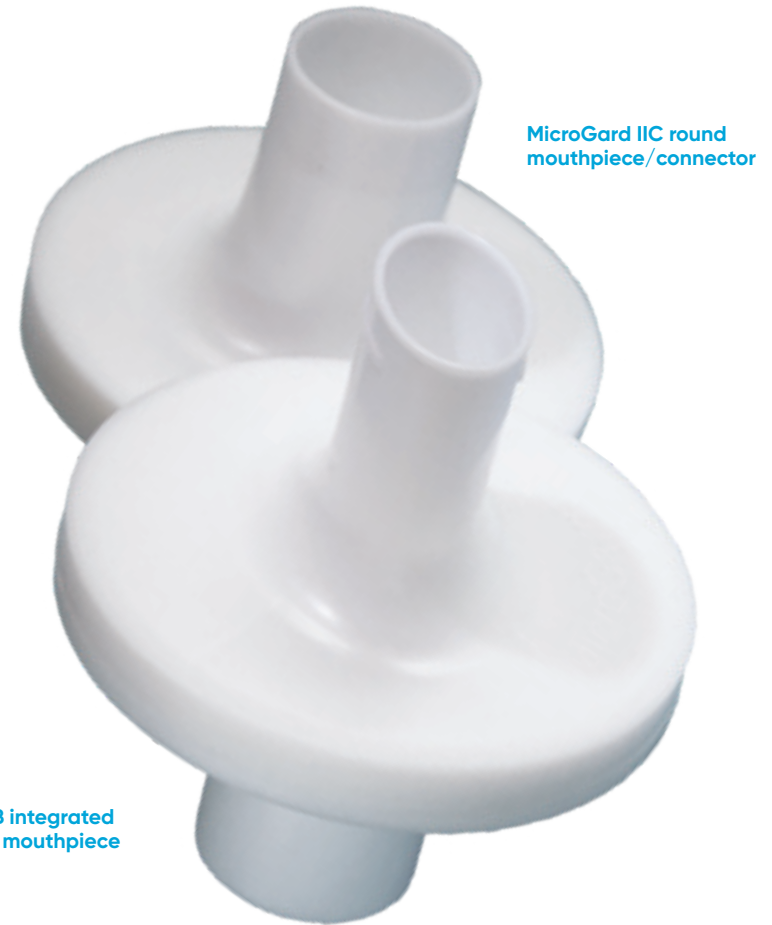
MicroGard IIC round mouthpiece/connector