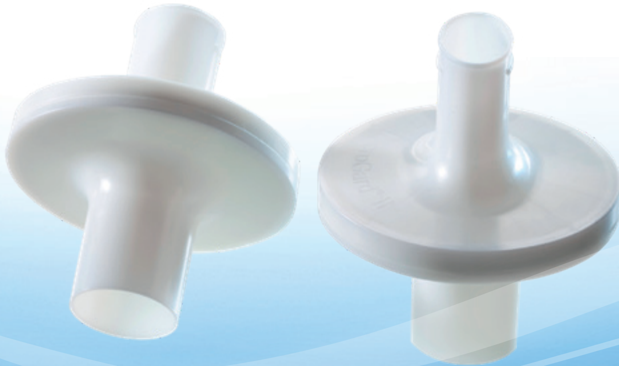
MicroGard® II pulmonary function filter