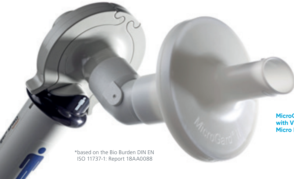
MicroGard IIB integrated oval-shaped mouthpiece

MicroGard II filters are the filters of choice for use with Vyntus®, JAEGER® MasterScreen, Vmax®, and Micro Medical PFT instrumentation.